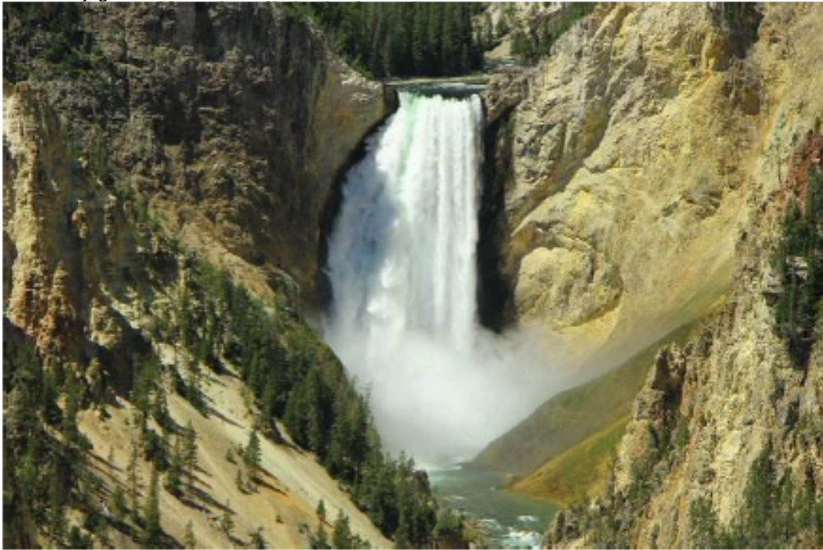
Doc 1 - Photographie de la cascade